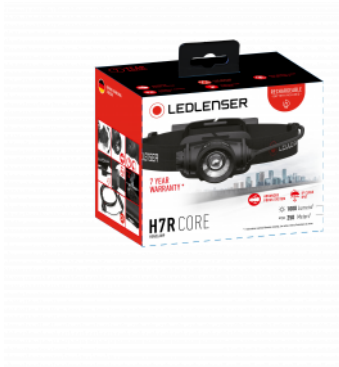
Exemplary Packaging Illustration