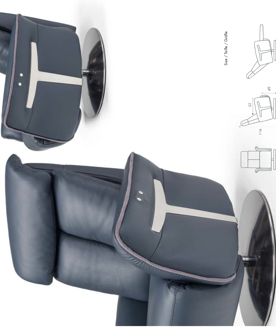
Size / Taille / Größe