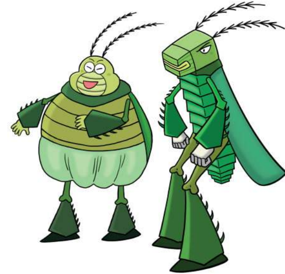
CHIEF BRAINY The leader of the locust swarm, he is often referred to as "Chief"