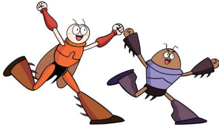
CRICKID He is having fun!