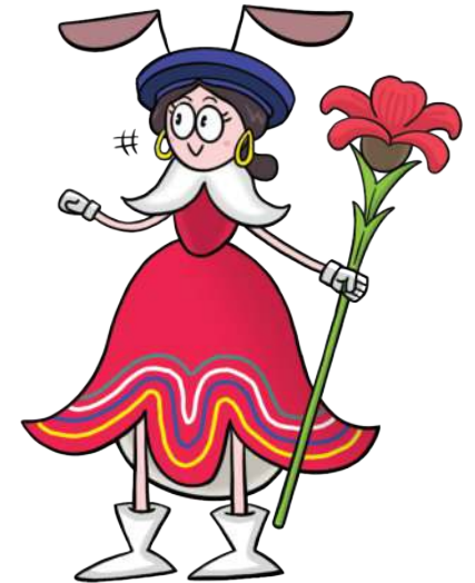
QUEEN ANNE The beloved young ruler of Ant Land