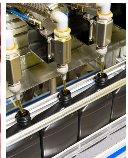
On the Line

Combine NIRQuest with our line of light sources, accessories and software for a wide range of application challenges.