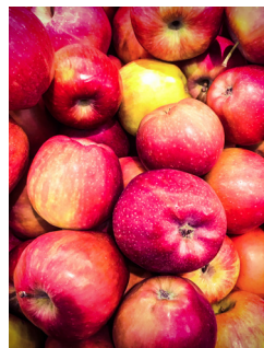
On the Farm

All NIRQuest spectrometer models have a replaceable slit design, increasing measurement flexibility. The freedom to adjust the width of the slit helps eliminate configuration trade-offs by giving users the ability to adapt spectrometer performance, without the need for recalibration. Also, users can add to NIRQuest an optional internal shutter, to manage light throughput and dark measurements. The shutter is useful for applications where placing an external shutter is difficult, such as emissive setups and probe-based measurements. Also, internal shutters are more convenient for applications where light intensities change, requiring users to dynamically adjust integration times and renormalize the spectrometer. Operation via software makes shutter control as simple as a few keystrokes.