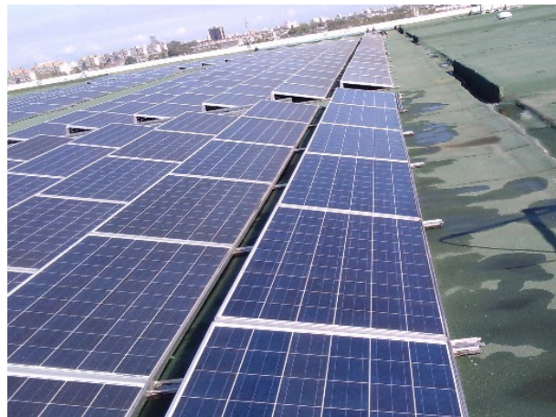
Polywater's Solar Panel Wash is safe for users and the environment.

For more information, please see the Solar Panel Wash Water-Saving White Paper .