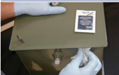
Clean area with cleaning wipe before applying sealant