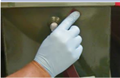
Sand or brush repair area