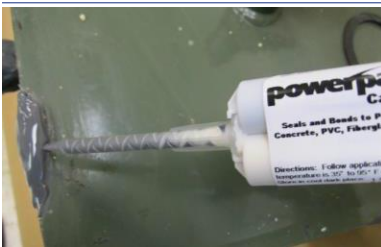
Apply PowerPatch over Putty patch or leak area

The PowerPatch should be a uniform light gray color with no streaking when it comes out of the mixing tip.