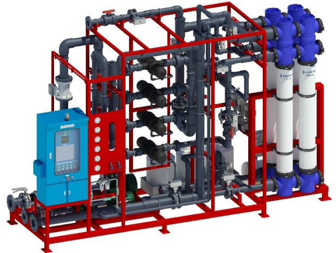
*The above photo of ADES-UFX-203-00 is for illustration purpose only.

X-line is unique in the market for its serviceability, scalability and flexibility. With the X-line concept one can construct a plant with minimum design efforts and constraints.