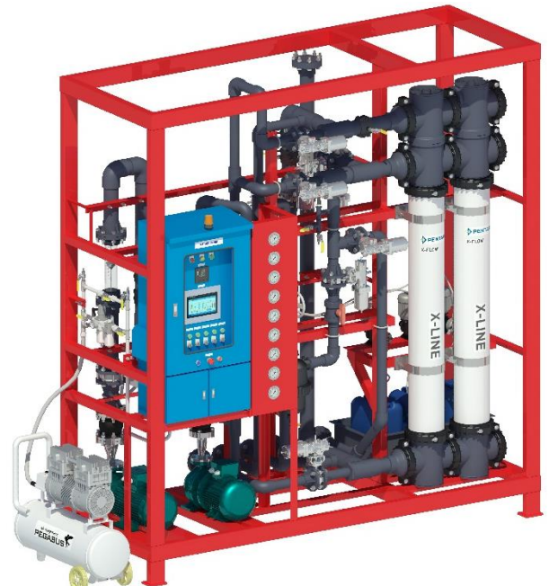
*The above photo of ADES-UFX-103-00 is for illustration purpose only.