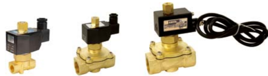
2W040-10NO 2W160-15NO 2W250-25NO-E