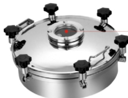
人孔+视镜 Man hole cover +Sight glass

Height (H) can be customized to 120mm, 150mm, etc. The thickness can be customized to 4mm or other sizes. The amount of handles can be as per customers request.