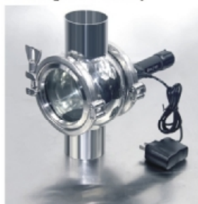
充电式灯视镜 Rechargeable battery