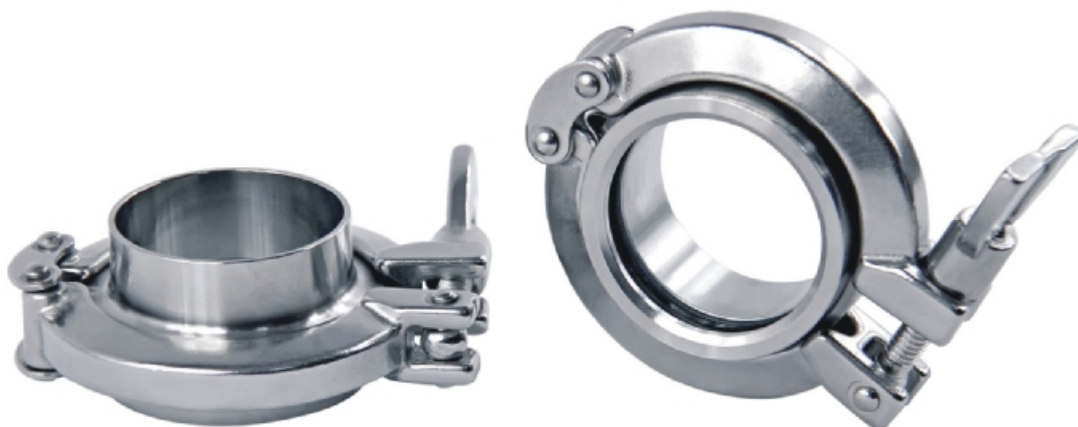
卡箍由任式视镜 Clamp union-type-sight-glass