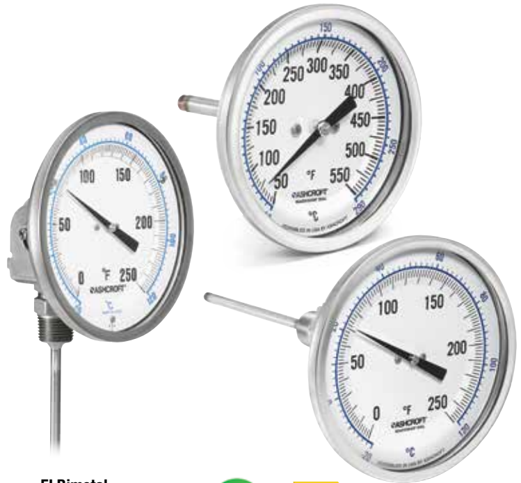
EI Bimetal 2", 3", 5" dial sizes