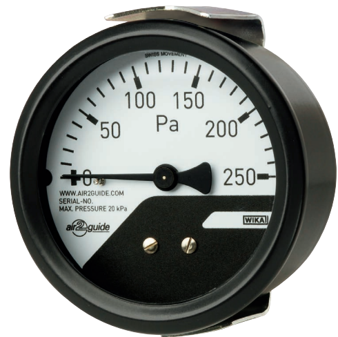
Differential pressure measuring instrument with mounting bracket, model A2G-mini