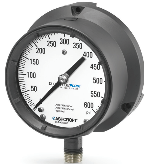
1379 4½", 6", 8½" dial size