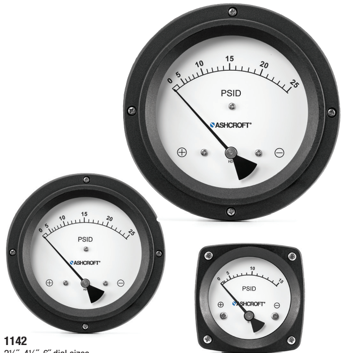
1142 2 1/2", 4 1/2", 6" dial sizes