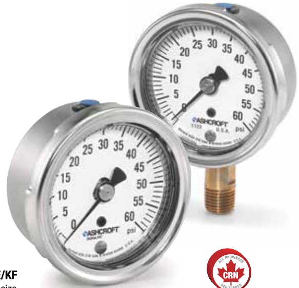
1122KE/KF 2½" Dial size