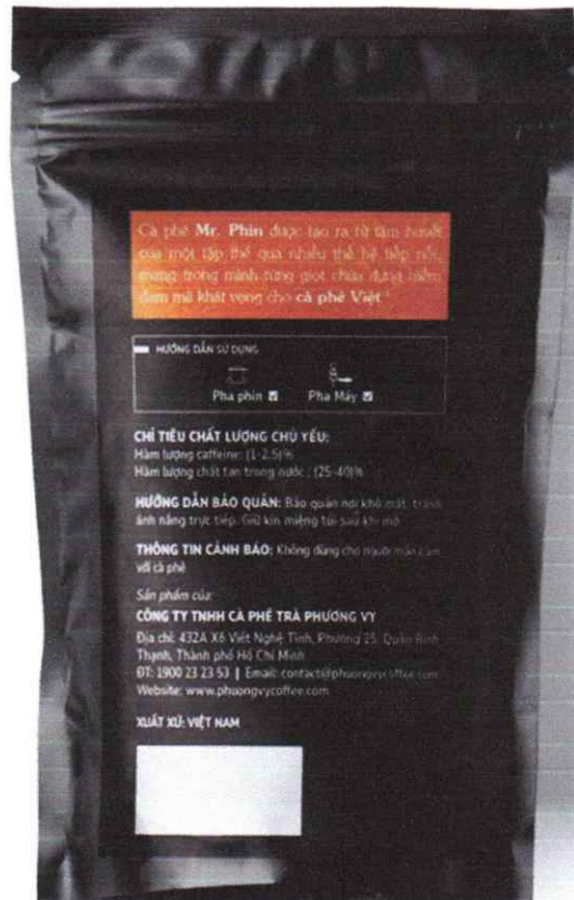
Bao bì sản phẩm “Cà phê Arabica Cầu Đất”