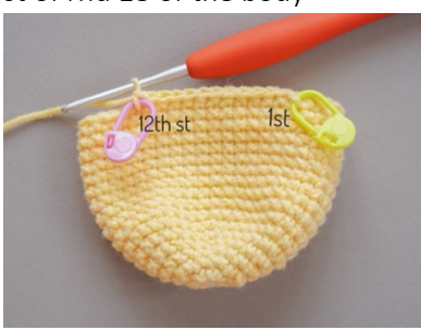
Place markers at 1st st & 12th st of rnd 18 of the body