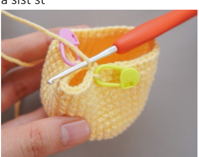
Join 2 marked sts together with Continue to crochet the head