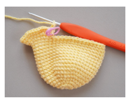
Join 2 marked sts together with Continue to crochet the head