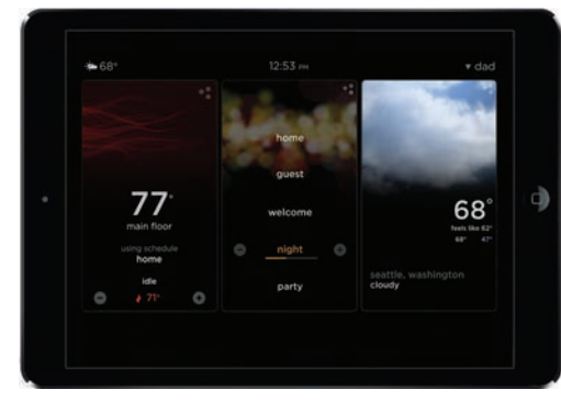
dashboard shown above