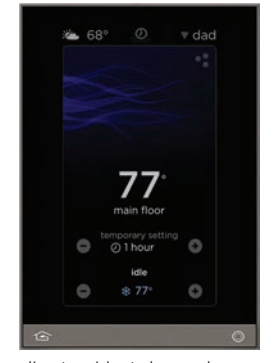
climate widget shown above