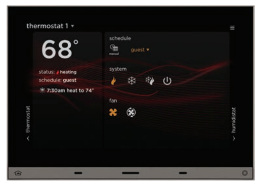
climate full screen shown above