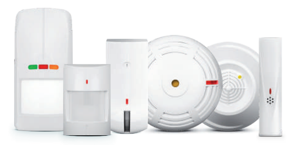
OPAL Pro, TOPAZ Pet, AGATE, ASD-150, DG-1 ME, ATD-100

Based on the INTEGRA alarm control panel, you can create an extensive system of wired or wireless devices (as well as a hybrid installation combining both technologies) that will effectively protect the area of even the largest property. Regardless of the advancement level of the solutions used, the system will remain easy to use for every household member.