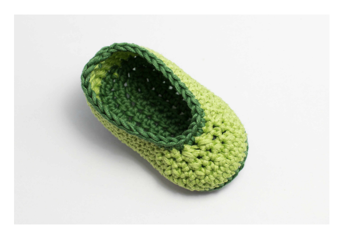
Rnd 7- Change yarn colour to "Dark Olive". Start crocheting in 1<sup>st</sup> st from the previous rnd. 1 sc in next 30 [34] sts. Sl st in 1<sup>st</sup> st of this rnd. Fasten off, and weave in loose ends.

Rnd 6- Start crocheting in 1<sup>st</sup> st from the previous rnd. 1 sc in next 15 [17] sts. 2 hdc2tog. 1 sc in next 13 [15] sts. Do not sl st in 1<sup>st</sup> sc of this rnd. (30 [34] sts)