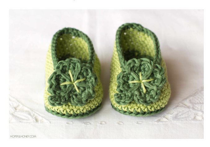
Hope you all enjoyed this pattern for some quirky and fun baby booties!

Taking your tapestry needle and "Apple Green" yarn, add some detailing to the centre of the shamrock.