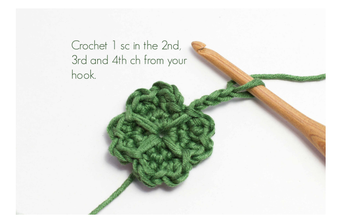
Rnd 3 - Ch1,*1 hdc and 1 dc in next st. Sl st in next st. 1 dc and 1 hdc in next st. 1 long sl st in next st,

right in the centre of the shamrock. Repeat from the * 4 times. (this creates 4 shamrock/clover leaves) Ch4, skip 1<sup>st</sup> ch from hook, 1 sc in 2<sup>nd</sup>, 3<sup>rd</sup> and 4<sup>th</sup> ch from hook. Sl st back down into cover. Fasten off, and weave in loose ends,