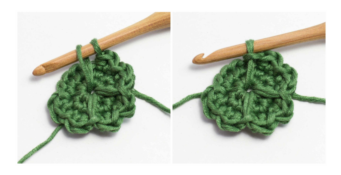
Rnd 2– Start crocheting in 1<sup>st</sup> st from the previous rnd. 2 sc in next 8 sts. Sl st in 1<sup>st</sup> st of this rnd.

Rnd 1- Ch2 using "Dark Olive" yarn, 8 sc in 2<sup>nd</sup> ch from hook. Do not sl st in 1<sup>st</sup> sc of this rnd. (8 sts)