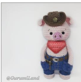
Bill the piglet