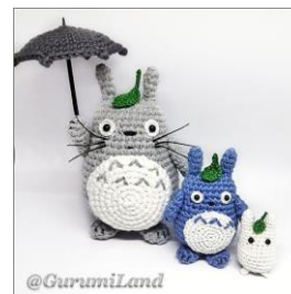
Totoro and his friends