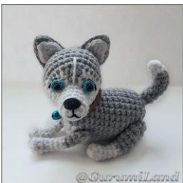
Movable husky puppy