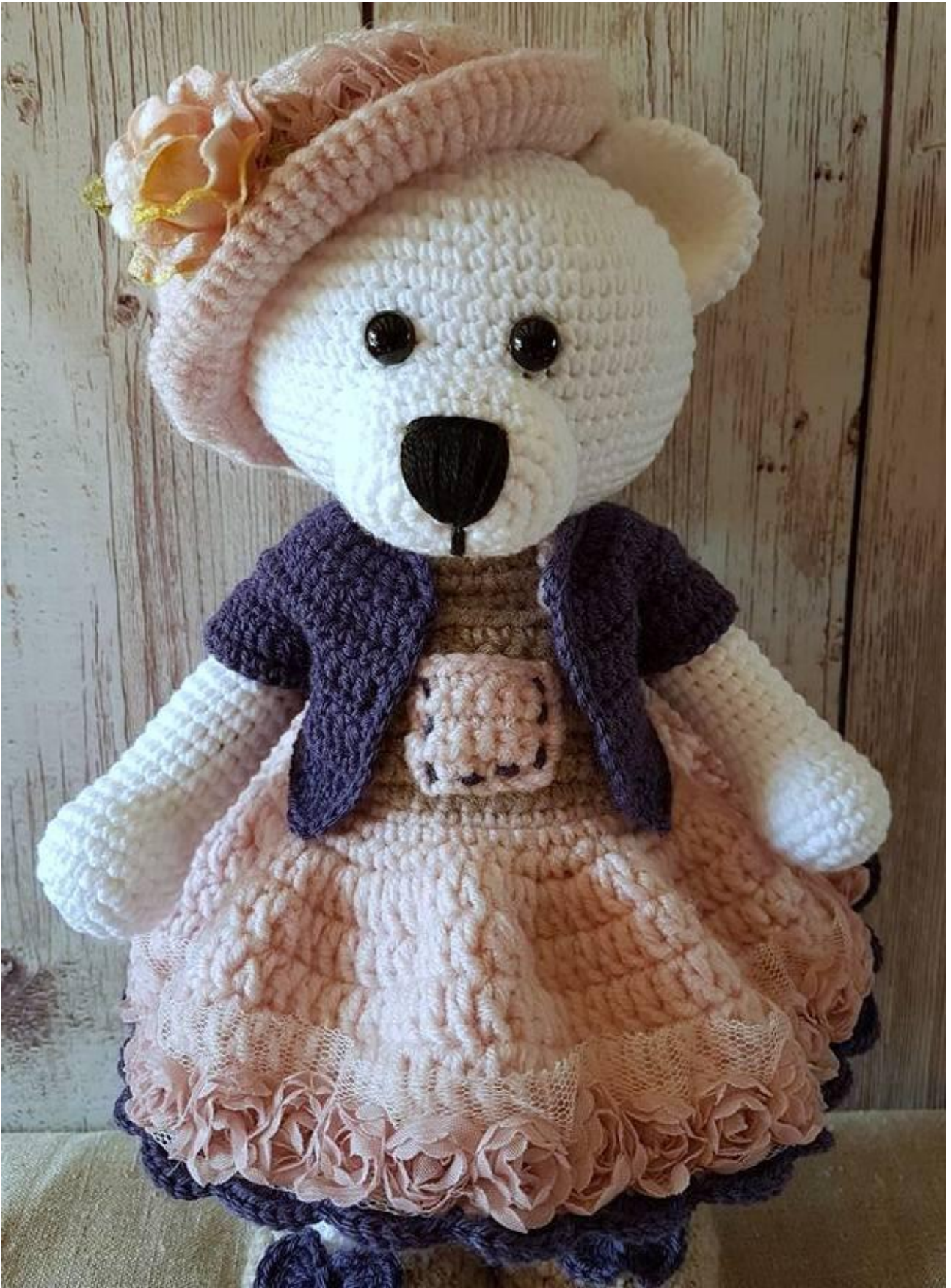
Valérie for ModelStyl