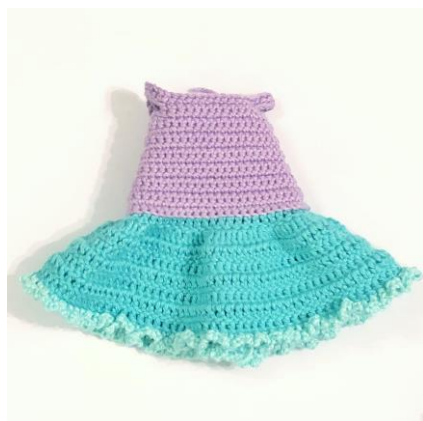
Pattern by LittleBeauMouse 2018 ©Caroline Price

This pattern and all pictures are for personal use only . You may not share, distribute, replicate, reproduce or re-sell this pattern in any way or form (online or offline). You may sell your finished product, but please reference my original pattern.