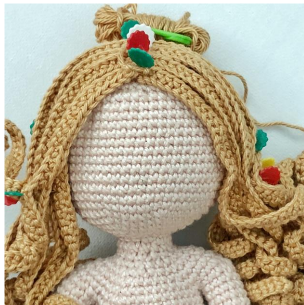
(back of head)

Pattern by LittleBeauMouse 2018 ©Caroline Price