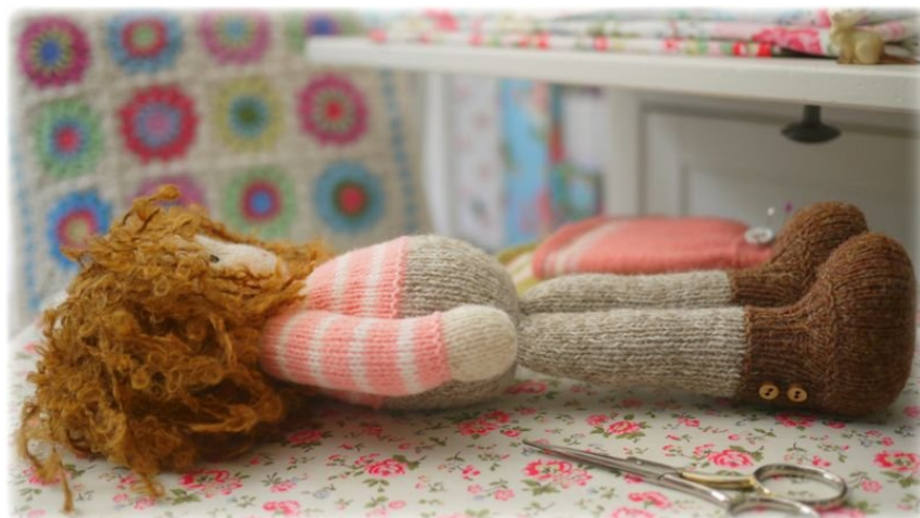
A doll body complete and ready for her pinafore....(see also P.15)

Finally attach each leg along lower body seam using yarn ends making small slip ( whip ) stitches then fasten off.