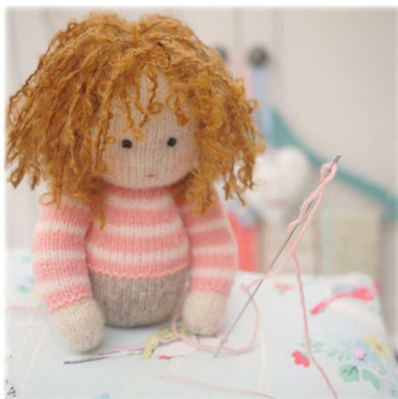
(Using a long doll needle to attach Belle's arms)