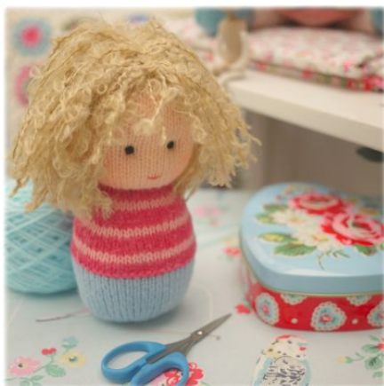
Fig.7 Add a few shorter strands at the front then stitch down a last top layer at centre parting only (shortest layer)