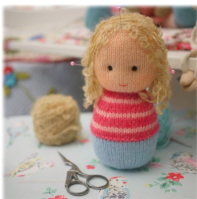
Fig.5 Cut yarn lengths ( approx 25cm ) stitching down at centre parting and again just below eye level ( point marked by pins ) using backstitch ( trim as you work or later ) No need to cover head completely this layer