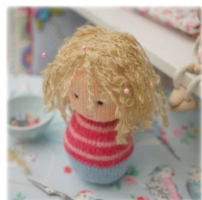
Fig.6 Now add a second layer ( just a little shorter this time ) stitching yarn down at centre parting plus a little further down ( between centre parting/eye level )

( Tip: Anchoring doll to a cushion with long doll/ darning needles and turning as you work may be helpful)