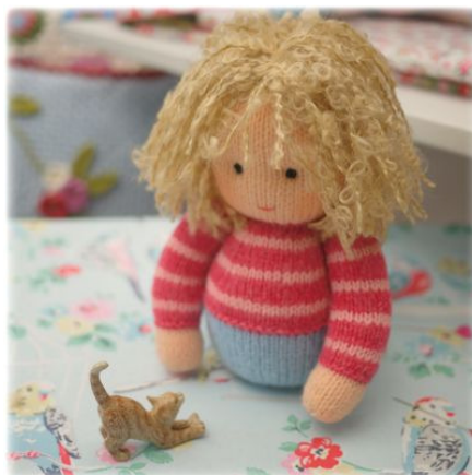
Fig.8 Finally have one last check that cheeks & chin are filled out enough (using needle as described previously to move stuffing forward )

Molly's Sailor Stripe Sleeves & Doll Hands (3mm Needles - Make 2) (carry yarns up side of work when working stripes taking care not to do this tightly) - See also photo P.11