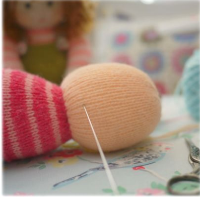
Fig.1 Move stuffing into cheek/chin areas by inserting needle between stitches

Next, using 3 strands of embroidery thread/ floss to embroider mouth insert needle from the back of head through to the front and make 2 small stitches for the mouth ( the larger upper stitch being 2 knitted sts wide and second stitch below being slightly smaller ) Secure ends at back of head and take into stuffing then out again and cut ( distance between eyes and mouth make an equilateral triangle )