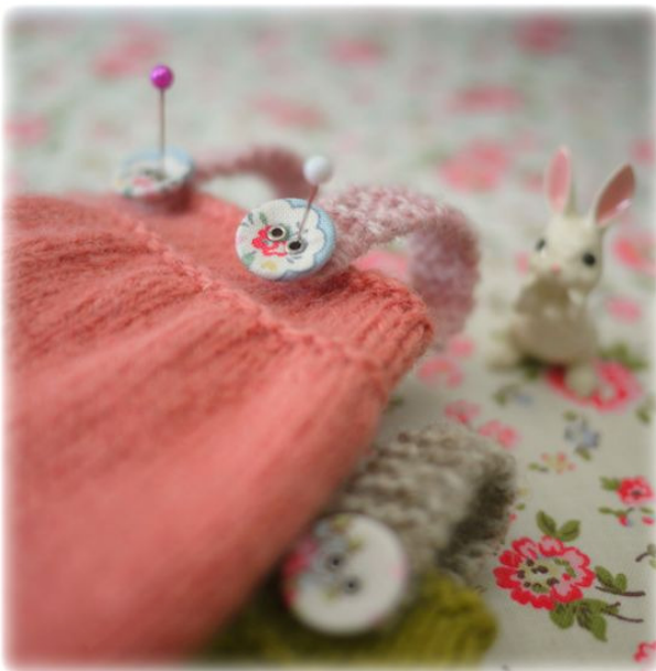
(Dolly pinafores ready for straps and buttons)

Make Up as for Molly's arm and hand ( see P.8 )