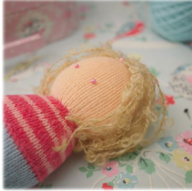
Fig.2 Pin some hair temporarily in place then position eyes by inserting pins