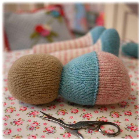
(Photo above - neck gathered 12.5cm/ head is now a firm round ball shape)

Using a tapestry needle gather around last row worked of jumper (as photo above) using double thickness yarn (finished neck circumference measures 12.5cm) Tip: Check measurement by placing string around neck then measure against a ruler/ tape measure before knotting and taking ends into stuffing)