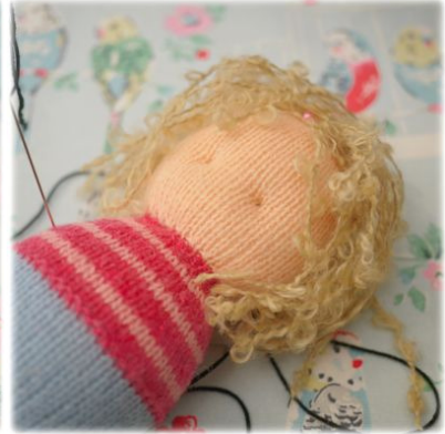
Fig.3 Eye sockets in situ ... your doll's face takes shape.

N.B Moving the stuffing into the cheek, chin and forehead areas (Fig.1) is important to create a good shape Once the face is embroidered you may want to add some initial colour to the cheeks too (P.15)