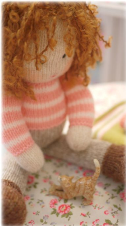
Tearoom Dolls in 'sitting' posture