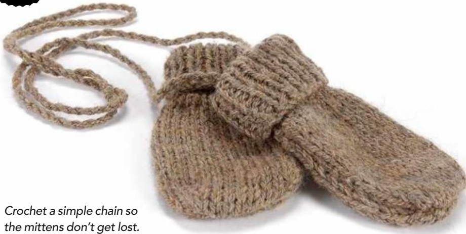
Crochet a simple chain so the mittens don't get lost.