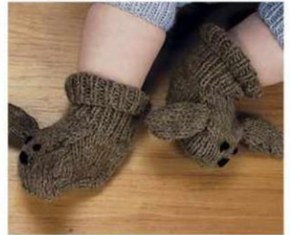
Embroider the features on the booties to give them a cute doggy face.