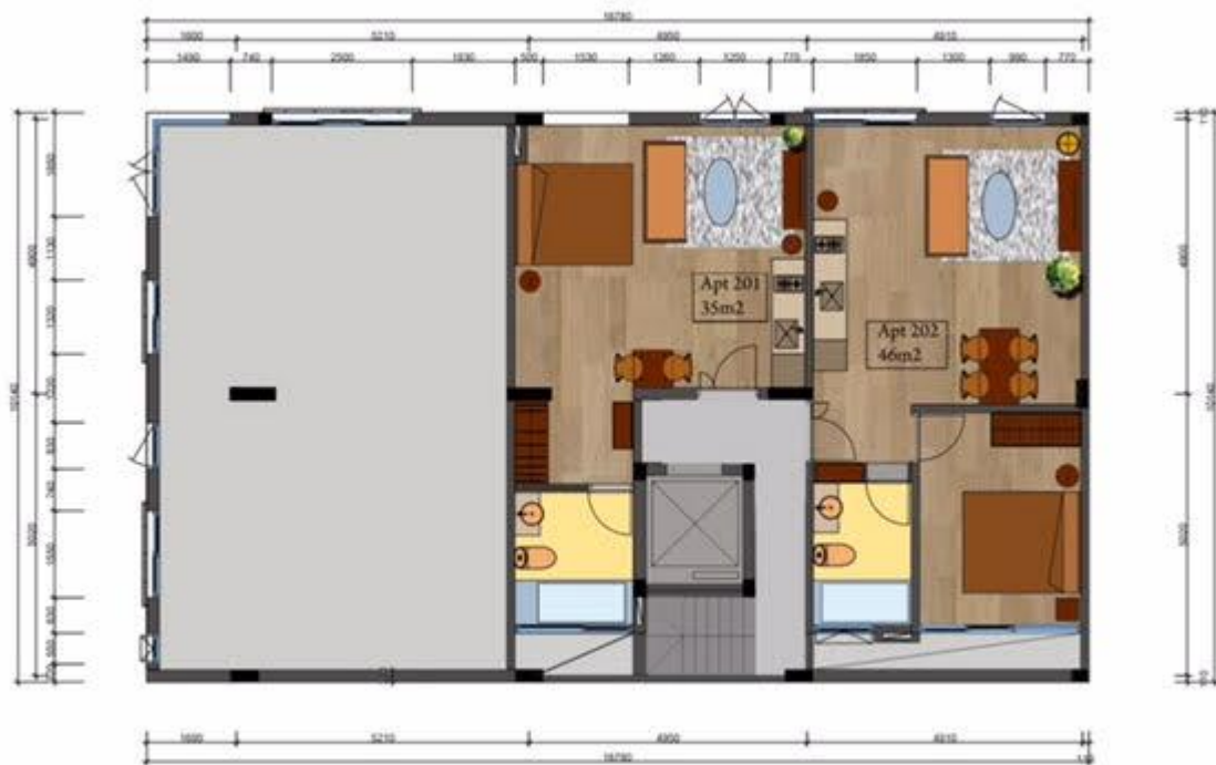
2th FLOOR PLAN