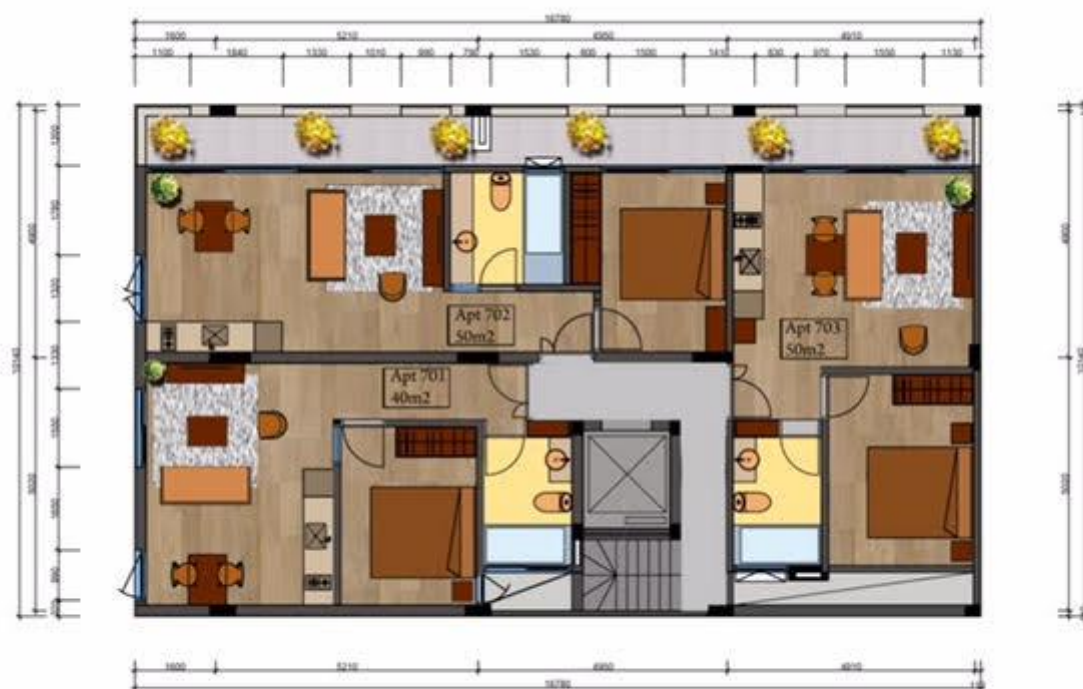
7th FLOOR PLAN