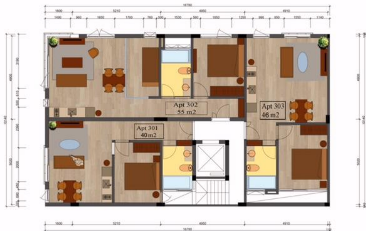
3th FLOOR PLAN