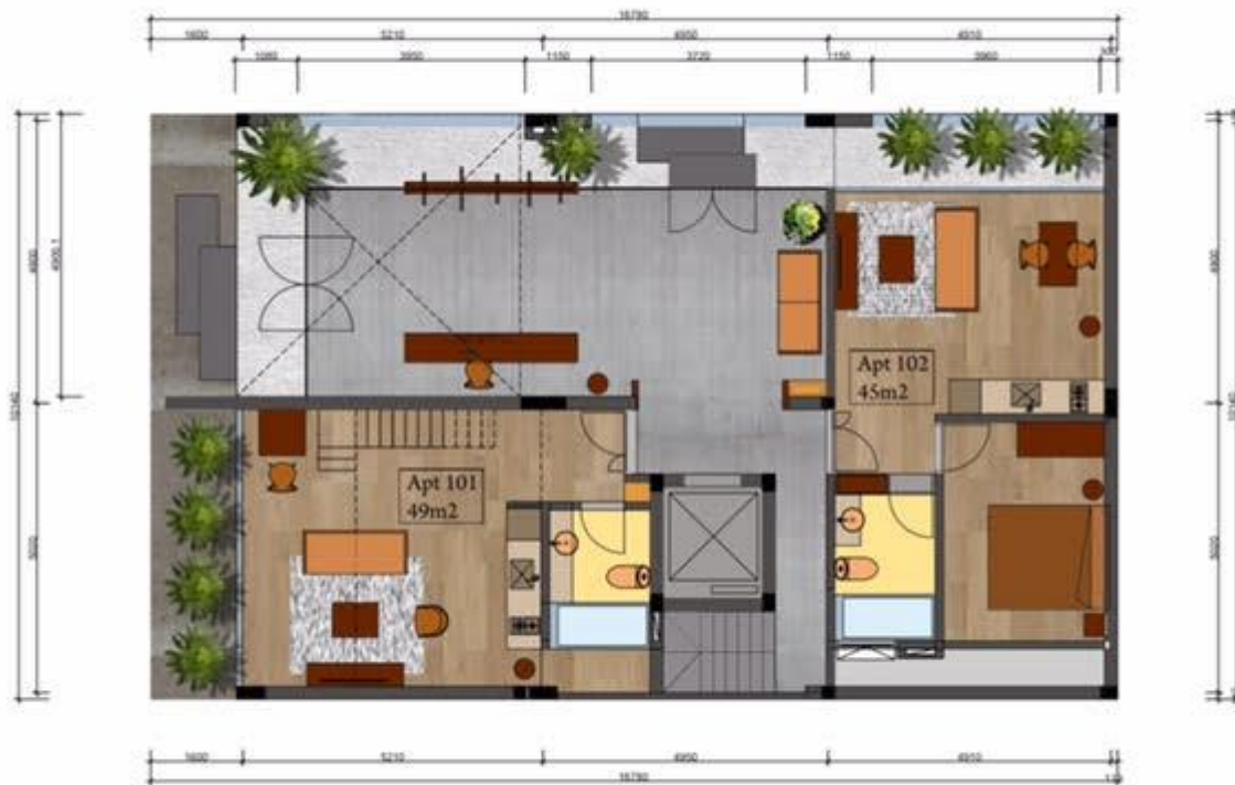
1th FLOOR PLAN