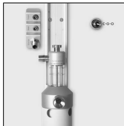
Integrated Scavenging System