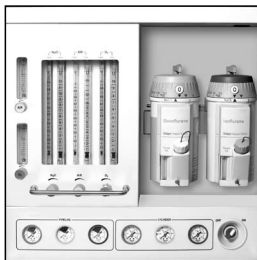
Dual Flow Meters (2xN 2 O, 2xO 2 , 2xAir)

Tidal Volume (no volume, upper limit, lower limit) Airway Peak Pressure (upper limit and lower limit) Oxygen Concentration (upper limit lower limit) Low O 2 supply with automatic N 2 O cut-off PEEP Apnea Power failure Low battery