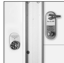
GCX Compatible Mounting