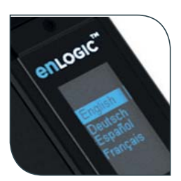
Large and easy-to-view oLED