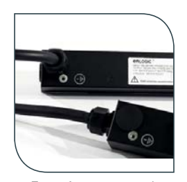
Top or front power cords available.

Distribution of power inside a data centre environment where a variety of different power connectors are required.